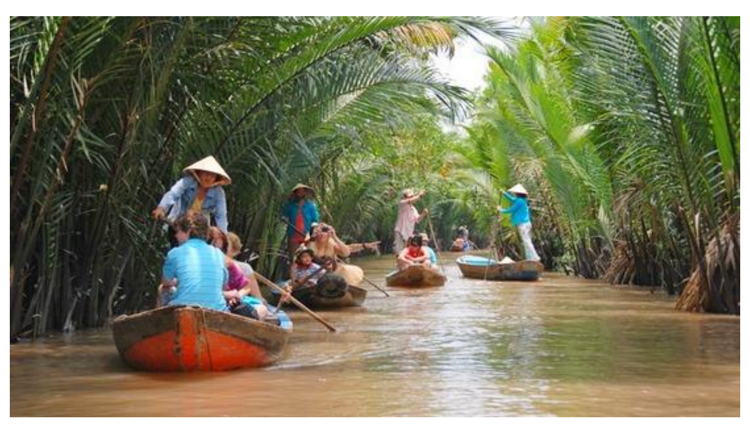
Enjoy peaceful moments when paddling down the stream and admire the stunning landscapes of Mekong River